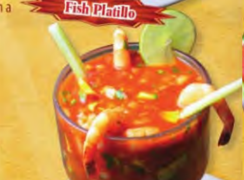
Cocktel de Camaron

*NOTICE: COOKED TO ORDER CONSUMING RAW OR UNDERCOOKED MEATS, POULTRY, SEAFOOD, SHELLFISH OR EGGS MAY INCREASE YOUR RISK OF FOOD BORNE ILLNESS, ESPECIALLY IF YOU HAVE CERTAIN MEDICAL CONDITIONS