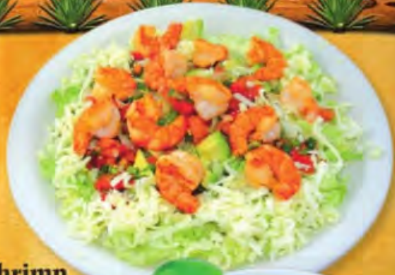
Shrimp Salad 10.25