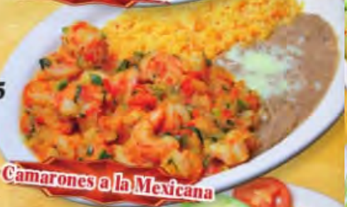
Camarones al Mexicana