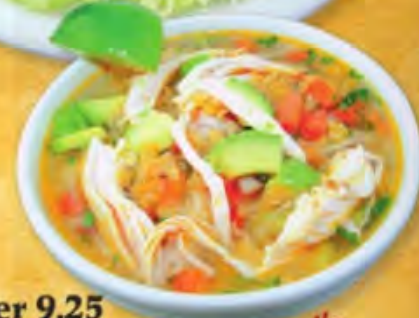
Caldo de Pollo Dinner 9.25

Chicken soup with pieces of chicken, rice, chopped avocados, pico de gallo and lime (With Grilled Shrimp instead of Chicken $10.50)