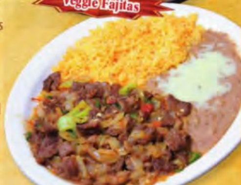
Carne a la Mexicana

Grilled chicken breast topped with avocado slices, served with two enchiladas and grilled vegetables