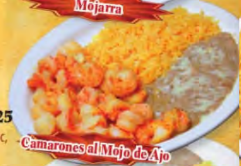
Camarones al Mojo de Ajo